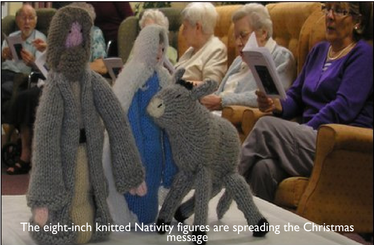
The eight-inch knitted Nativity figures are spreading the Christmas message